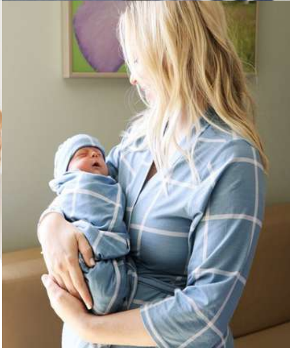
Suggested Maternity Robes