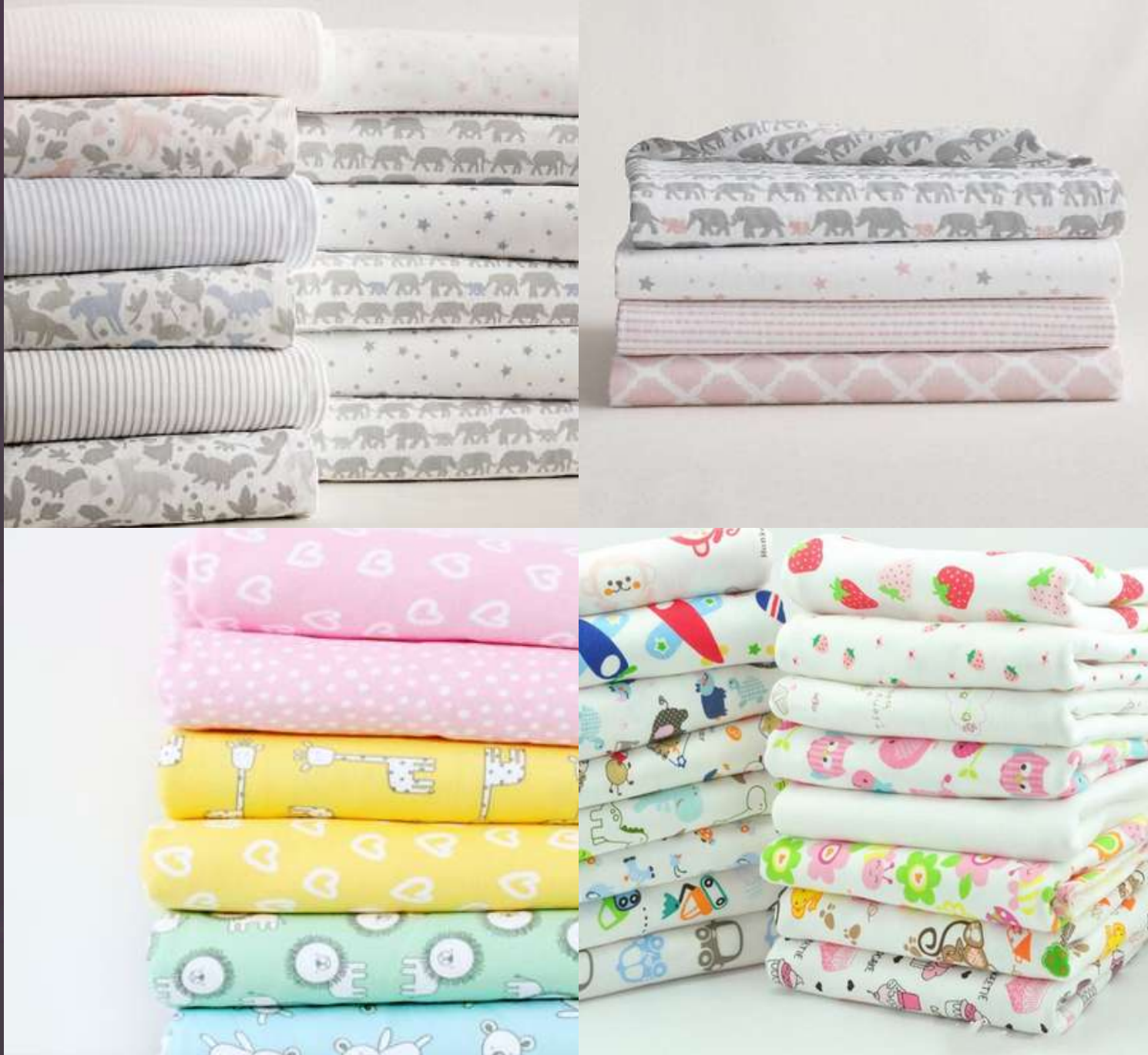
Baby Cot Bottom Sheets