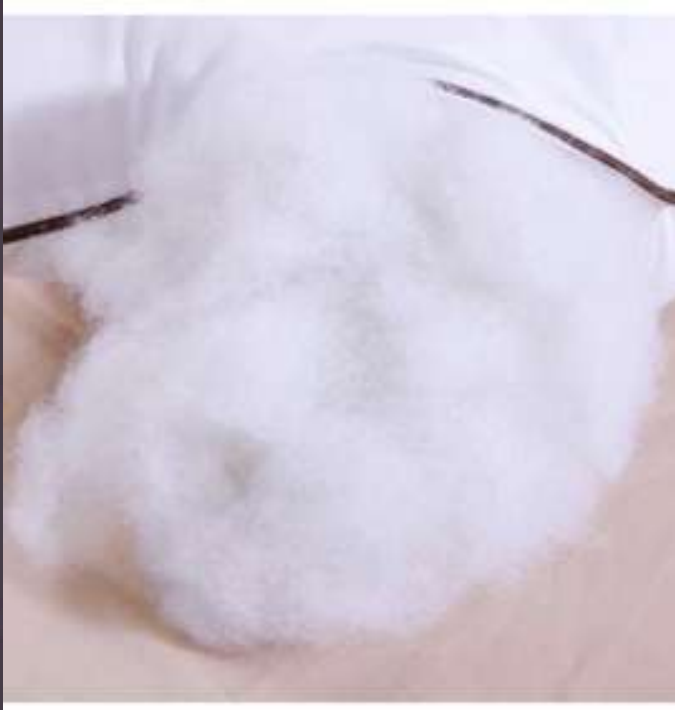
7D Hollow Fiber Fill