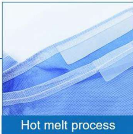
Hot melt process