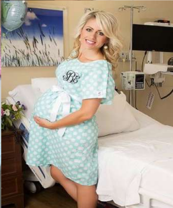
Suggested Maternity Robes